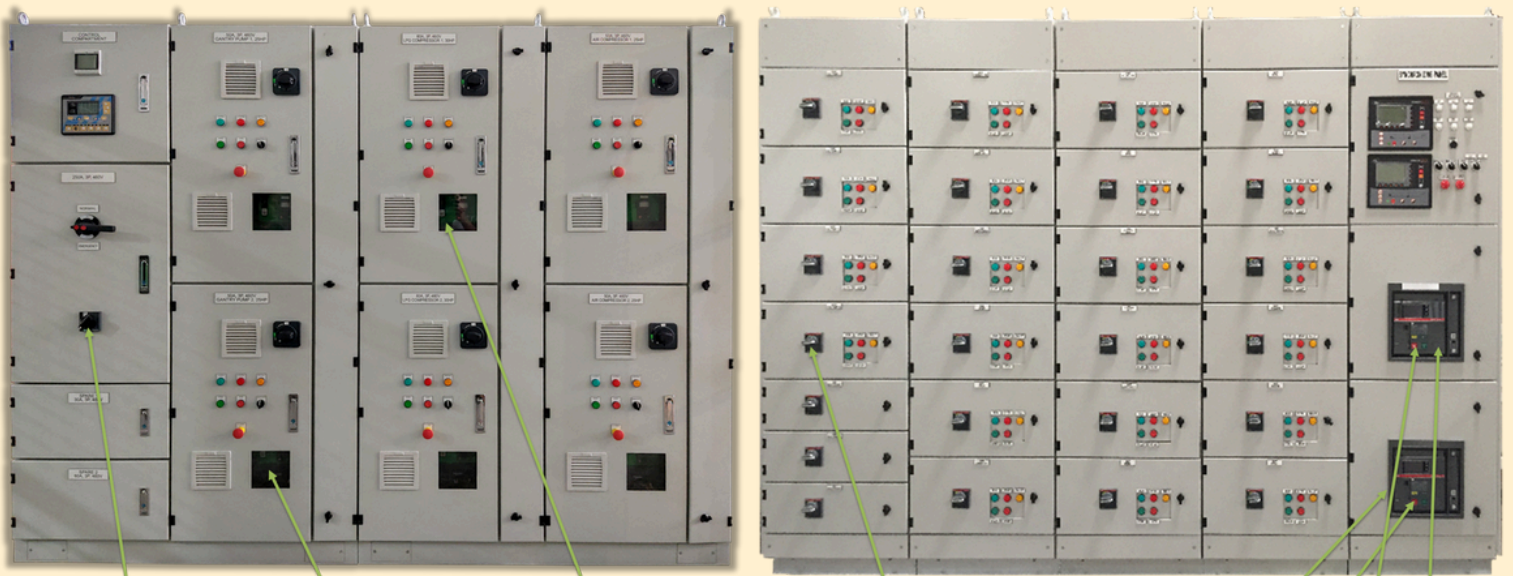
POWER METER DEVICES