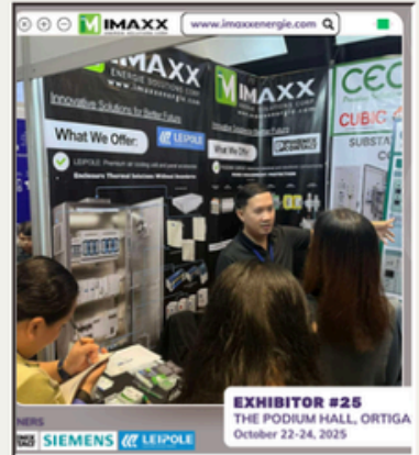
EXHIBITOR #25 THE PODIUM HALL, ORTIGA October 22-24, 2025