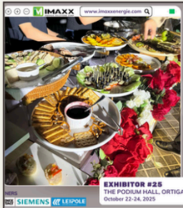
EXHIBITOR #25 THE PODIUM HALL, ORTIGA October 22-24, 2025