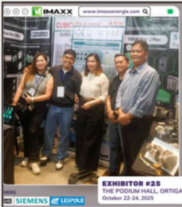
EXHIBITOR #25 THE PODIUM HALL, ORTIGA October 22-24, 2025