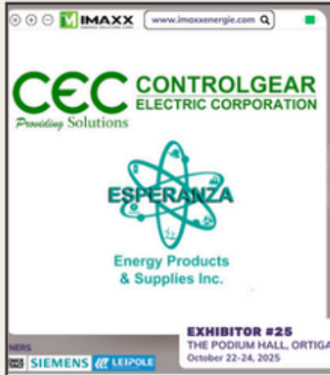
EXHIBITOR #25 THE PODIUM HALL, ORTIGA October 22-24, 2025