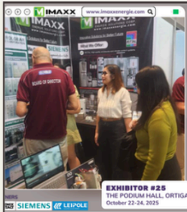
EXHIBITOR #25 THE PODIUM HALL, ORTIGA October 22-24, 2025