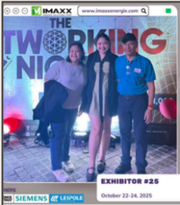
EXHIBITOR #25 THE PODIUM HALL, ORTIGA October 22-24, 2025