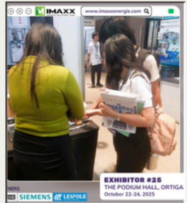
EXHIBITOR #25 THE PODIUM HALL, ORTIGA October 22-24, 2025