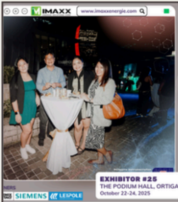
EXHIBITOR #25 THE PODIUM HALL, ORTIGA October 22-24, 2025